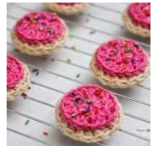
FROSTED CROCHET COOKIE PATTERN