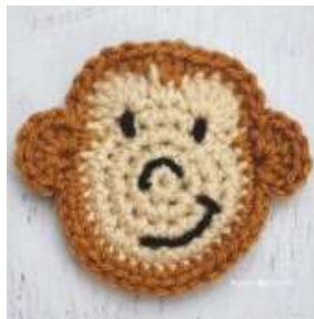
M IS FOR MONKEY: CROCHET MONKEY APPLIQUE