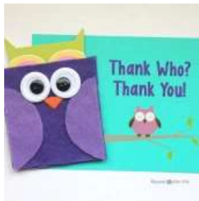
FELT OWL GIFT CARD HOLDER