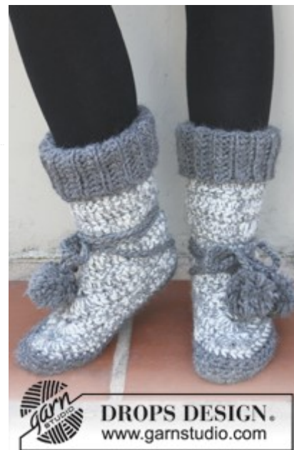
DROPS Extra 0-888

Size 11/L/8mm crochet hook or size needed to obtain gauge.