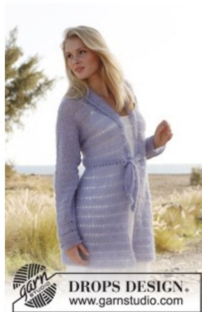
DROPS Extra 0-914

DROPS CROCHET HOOK size 5 mm / H/8 – or size needed to get 14 dc x 7 rows of diagram A.1 = 10 x 10 cm / 4" x 4".