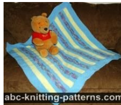
Easy Garter Stitch Baby Blanket