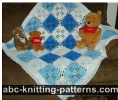
Square Motif Baby Blanket

If you liked this pattern, you might also like: