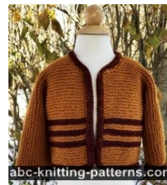
Easy Garter Stitch Baby Cardigan